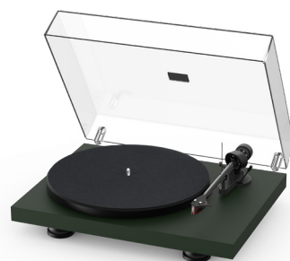
Satin Fir Green