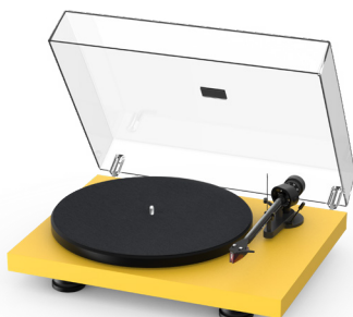
Satin Golden Yellow