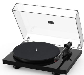
High Gloss Black