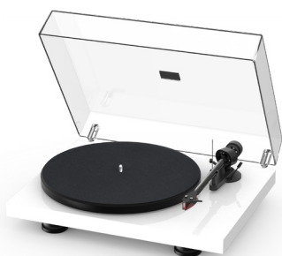
High Gloss White