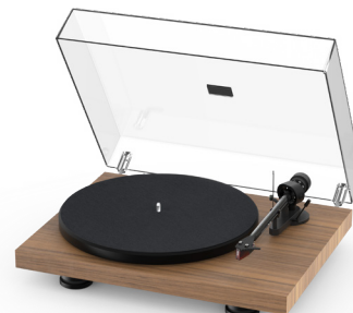
Satin Real-Wood Walnut Veneer